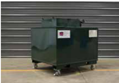
FUEL, LUBE, WASTE OIL, DEF