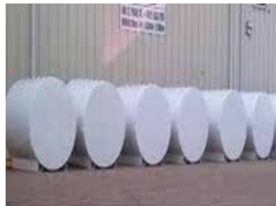
ROUND OR RECTANGLE