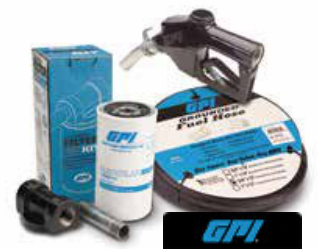
PUMPS & ACCESSORIES