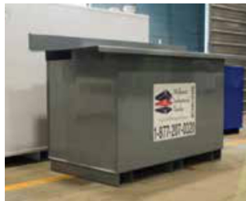
WORK TOP TANKS